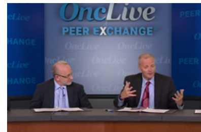
Adjuvant Aspirin in Colorectal Cancer Read More >>