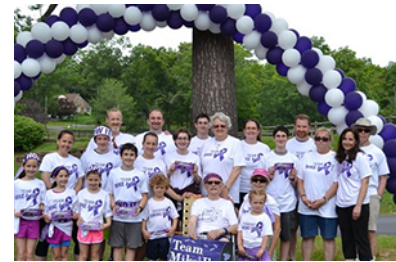
Cancer, Candy & Coincidence: The Story of Mike&Ike Read More >>