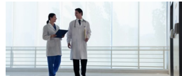
Costly Breast Cancer Treatment More Common At For-Profit Hospitals APRIL 28, 2014